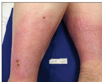
Figure 1b – 2 weeks