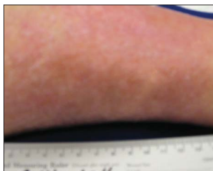
Figure 1d – right leg, 4 weeks